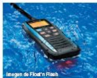
Imagen de Float'n Flash